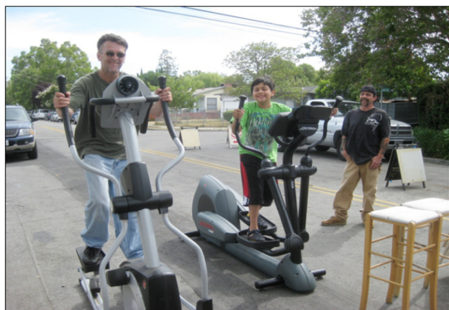
Two exercise machines in perfect working conditions were our largest items this year, as seen tested by volunteers at the SNAIL Yard Sale on June 14 th .