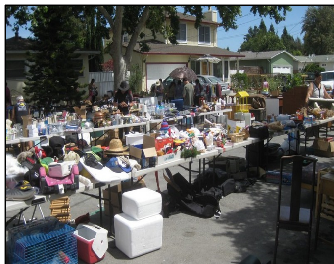
2014 SNAIL Yard Sale, June 14 th & 15 th