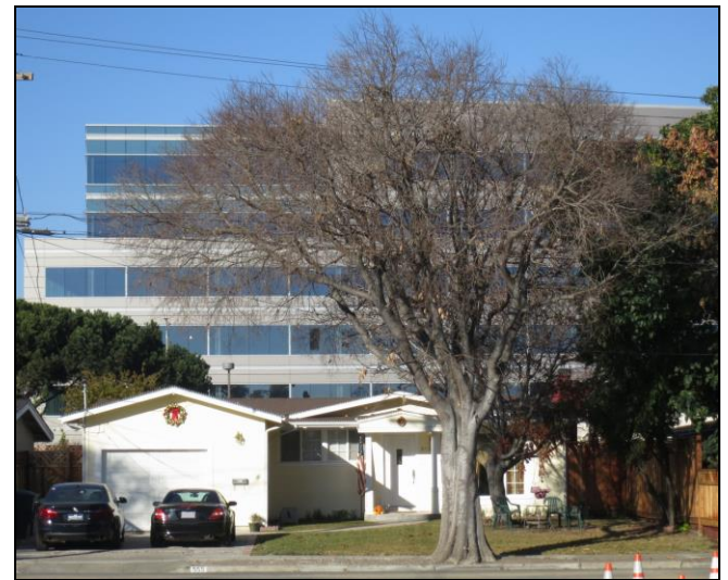
View of LinkedIn buildings in the winter after the leaves have fallen on Pine Ave.