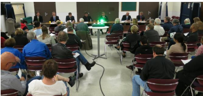
Voters filled up the Fair Oaks building for the SNAIL Candidate Forum, September 25, 2013.