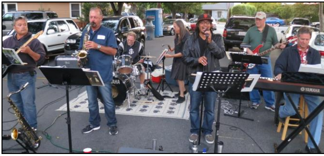
Fun music at NNO was provided by "The Sound Effect".