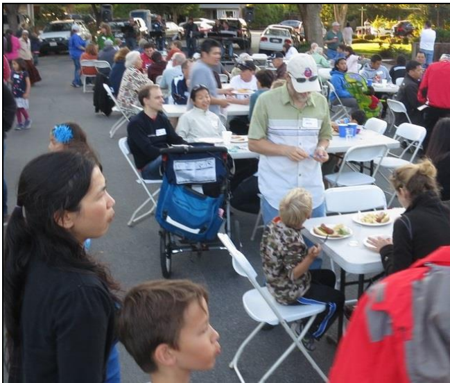
Part of the gathering of neighbors at SNAIL's National Night Out party, Aug. 6th.