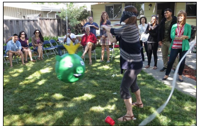
There was one piñata for the kids and one for the adults.