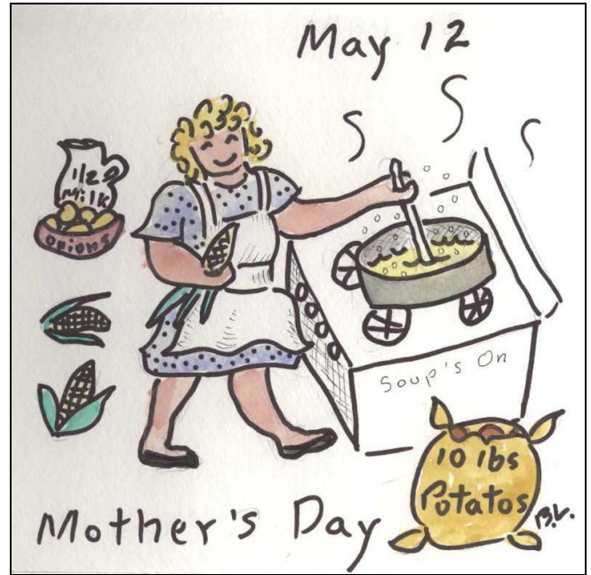
IOWA CORN CHOWDER - Page 14 of the SNAIL COOKBOOK