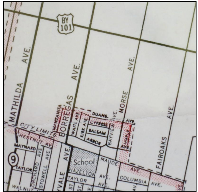
"SNAIL" neighborhood, circa 1950

During the Centennial Celebration, I found a 1950 map of Sunnyvale at one of the exhibits. It's interesting to note that most of what we now refer to as "SNAIL" (the area bordered by Hwy. 101, Mathilda Ave., Maude Ave., and Fair Oaks Ave.) did not even have streets and was not even within Sunnyvale city limits. The primary residential streets were parts of Manzanita, Waite, Kirk, Arbor, Cypress, Duane, Bayview, Morse, and Maple.