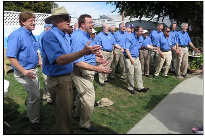
The Peninsulaires entertained and delighted with song.

SNAIL needs a volunteer to set up and maintain a SNAIL Facebook page. If you can help, please contact Jim at SNAILchair @ snail .org .