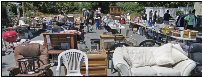
The SNAIL yard sale at the north end of Carolina Ave., June 9 th .

There is a time lapse video of the end of the 2012 yard sale on YouTube. Go to www.YouTube.com and search on "SNAIL yard sale". The full name of the video is, "SNAIL yard sale clean up, time lapse". This video compresses 2 hours into 8 minutes.