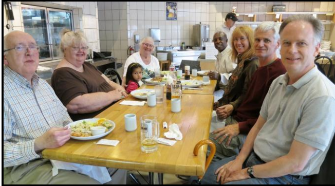
SNAIL Dinner Nite Out on June 4th at Gombei Bento