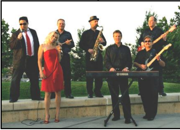
Dance to The Sound Effect at NNO!

Our favorite annual block party, SNAIL's National Night Out, will be back on Tuesday August 7, 6:30 pm to 9:00 pm. Same location as last year: E Arbor Ave at Morse Ave. Free BBQ hot dogs and sausages, live entertainment, jump house, and fire engines! Come meet neighbors and our city safety officers!