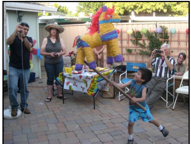
Even with the piñightiest ones swinging the stick, it took quite a while to break the piñata open, May 5 th .