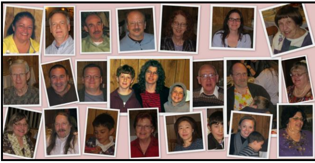
SNAILS enjoying the annual Chinese New Year Dinner, Shanghai Restaurant, Feb. 27