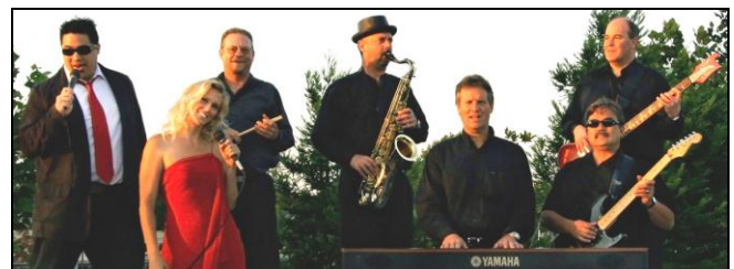
Dance to music provided by "The Sound Effect" at NNO!

NATIONAL NIGHT OUT A Neighborhood Block Party E. Arbor Ave. @ Morse Ave. August 2, 2011 6:30 p.m. to 9:00 p.m. BBQ, Music, and Fun (and it is free)