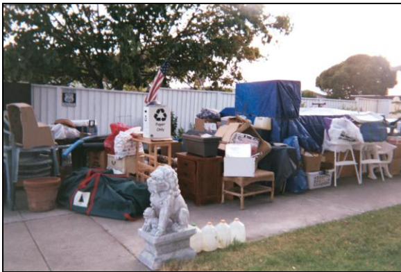
Before the Yard Sale

SNAIL enjoyed another successful fundraiser with our Annual Yardsale, June 11-12. Our great volunteer teams were there to set-up, clean-up, and visit with our shoppers both days. Special thanks to all our donors who brought items to fill our tables and shelves, plus furniture and other large items. Knowing that new items continued to arrive the full 2 days, many shoppers kept returning and buying more every trip. Everything was "priced to sell", keeping everyone smiling and happy with their purchase. This event added over $2000 to our treasury. Thank You, Everyone!