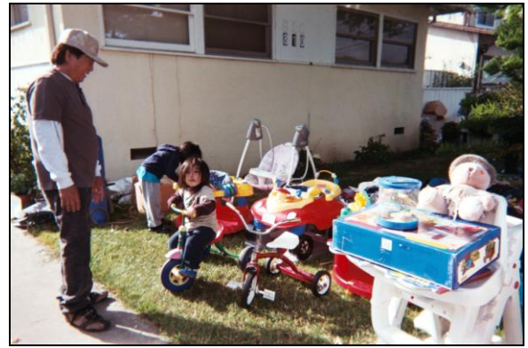
During the Yard Sale