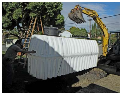
A backhoe lowers one of two 1,700 gallon cisterns into the ground.

The 3,400 gallon system filled up quickly with all the rain we had in 2010. The expectation is that this system will reduce outdoor water use by 7,500 to 22,500 gallons per year. That's a lot of water that will not come from California reservoirs via the delta or be pumped from underground aquifers. It's our family's most important contribution to reducing demand and the stress on California's water systems. It is great feeling to know you are watering your garden and flowers with rain captured and saved on your own roof.