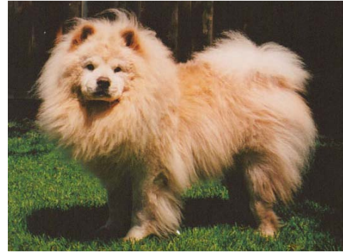
Star Tall Chief of Beechnut, she loves her backyard. Our very own fuzz ball, she is friendly but very shy.

We will publish, "Pet of the month" photos of pets living in the neighborhood, space permitting. Email your pet's portrait with you name, the name of your pet, your street name, and anything you would like to say about your pet to the editor at: SNAILeditor @ snail.org.