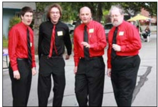
The Barbershop Harmony Quartet.