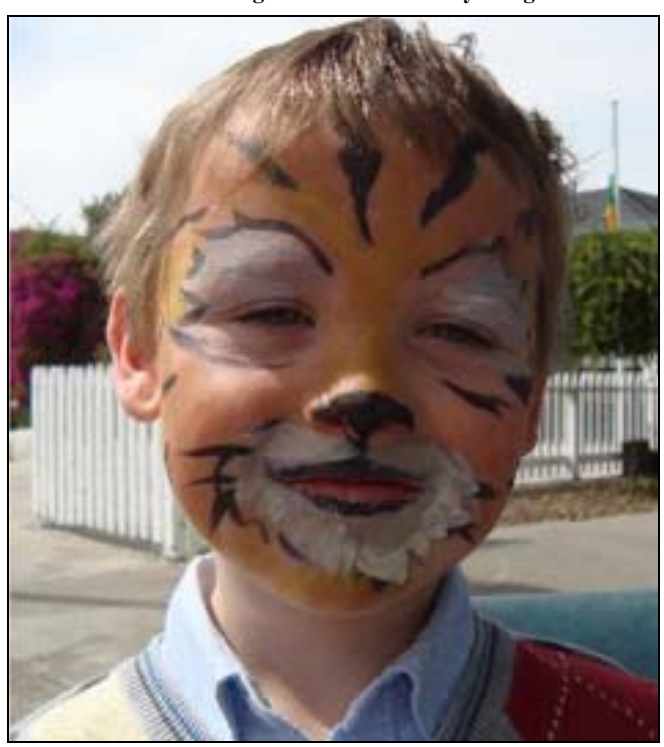
SNAIL's tiger has Irish roots