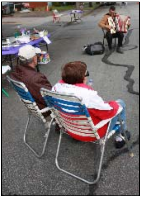
The sound of the accordion filled the street.