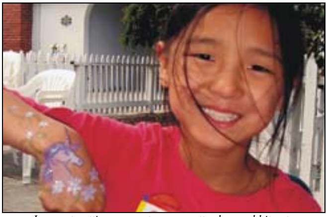
I am not putting my coat on no matter how cold it gets