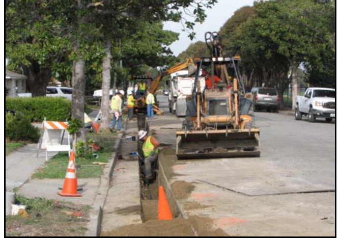
San Diego Avenue gets a new water main.