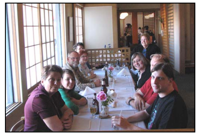
In support of our local restaurants, a group of nine SNAILs dined at Seto on June 17th.. Fine food and lively conversation was enjoyed by all.

Call Jeannie at 734-0739 for reservations.