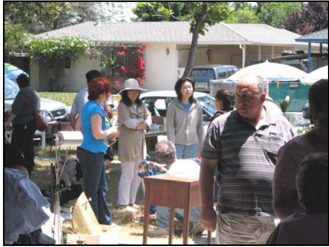
There was so much stuff, at times the buyers seemed dazzled.