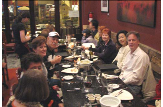
Dinner at the Rok, October 30th.

All SNAIL area homeowners, residents and guests are invited. Children are welcome. Refreshments will be served, bring you own beverage.