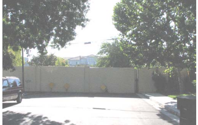
The threatened wall at the end of Ferndale Avenue.