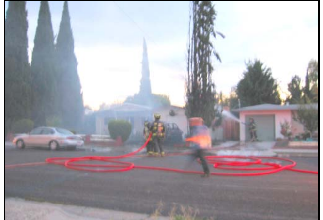
Sunnyvale Public Safety douses a tree fire on West Duane Avenue, October 19.

All SNAIL area homeowners, residents and guests are invited. Children are welcome.