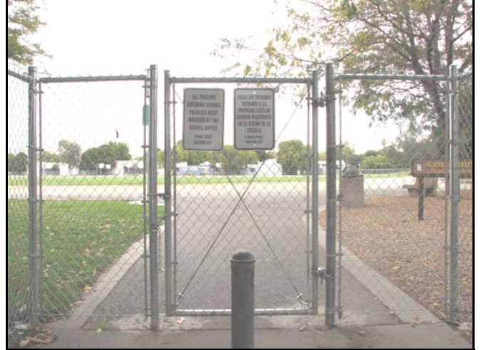
Security comes to Columbia School.

All SNAIL area homeowners, residents and guests are invited. Children are welcome.