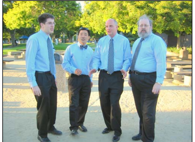
The Peninsula Barbershop Quartet at SNAIL's National Night Out event in Columbia Park on August 7, 2007.

All SNAIL area homeowners, residents and guests are invited. Children are welcome.