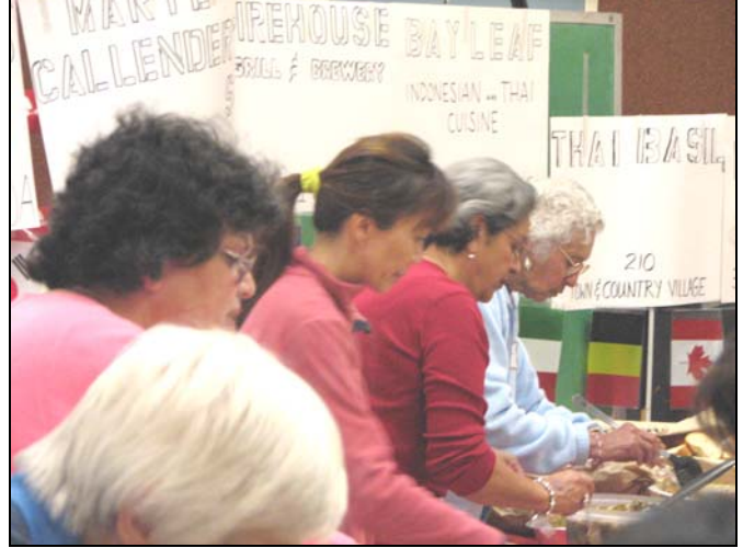
SNAIL volunteers serving up the food at the Taste of Sunnyvale Event, Saturday, April 21st.

All SNAIL area homeowners, residents and guests are invited. Children are welcome.