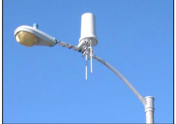
MetroFi Wireless Internet Access Point at the corner of West Arbor and Borregas.