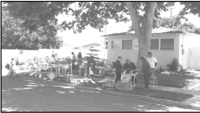
A previous yard sale. It's not too early to think about getting rid of your unwanted items!