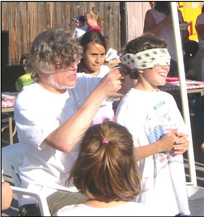
The Slime-Master prepares the next contestant in the "Rub the Slime on the Snail" game.