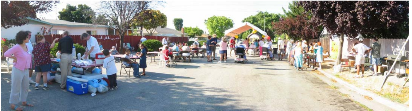
SNAIL's 10th Anniversary Party on Madrone Ave., July 16th.