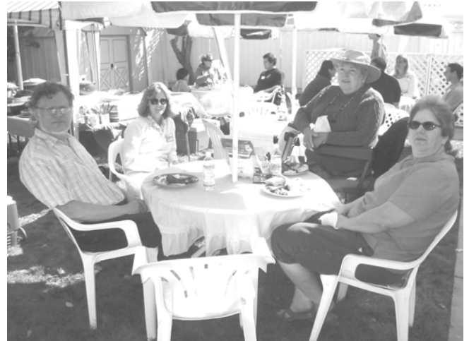
Contented diners at the SNAIL End-of-Summer BBQ, September 19, 2004.

Location: Longhorn Charcoal Pit Sunnyvale-Saratoga Road at Fremont Avenue Time: 6:45 p.m.