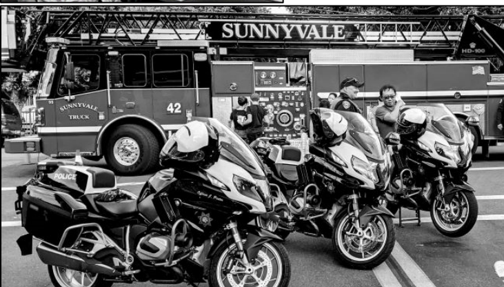
DPS's Finest: Fire Trucks/Police Motorcycles on Display