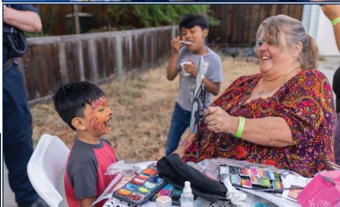
Lion-Face Painted by SNAIL's Very Own Shelley Capovilla.