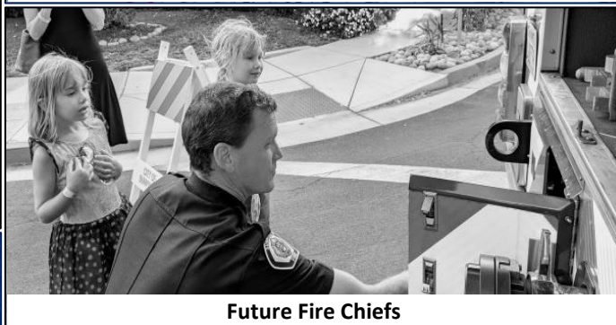
Future Fire Chiefs