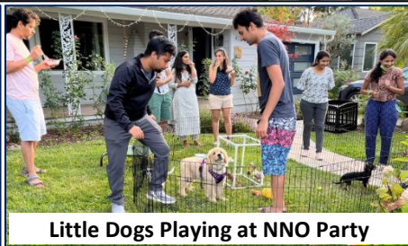
Little Dogs Playing at NNO Party