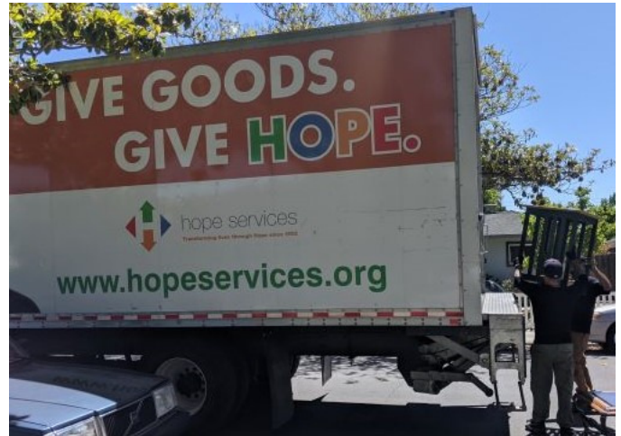
😊 Unsold items are donated to the Hope Services organization. 📌