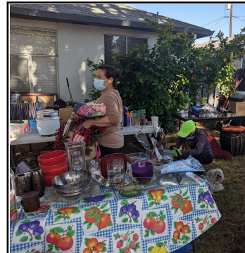
The Housewares 'Department' had some interesting items.