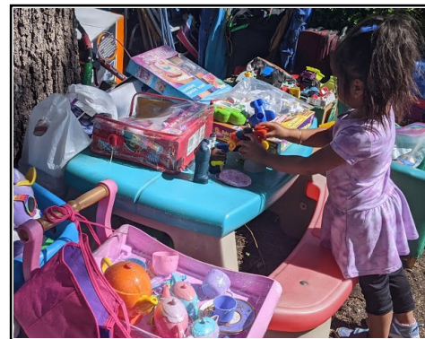
And toys for tots, too!