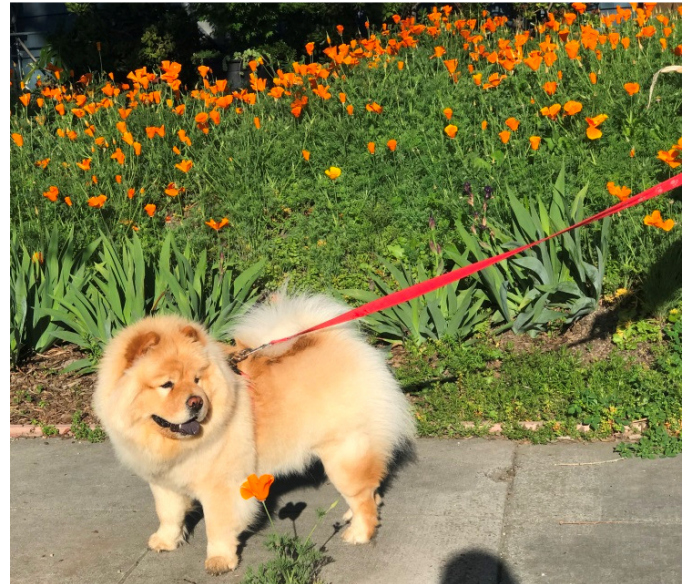
This beautiful young lady is California Poppy Flower and she lives on Beechnut with her family. "Flower" is a one-year old Chow Chow and she is very shy around people and dogs.