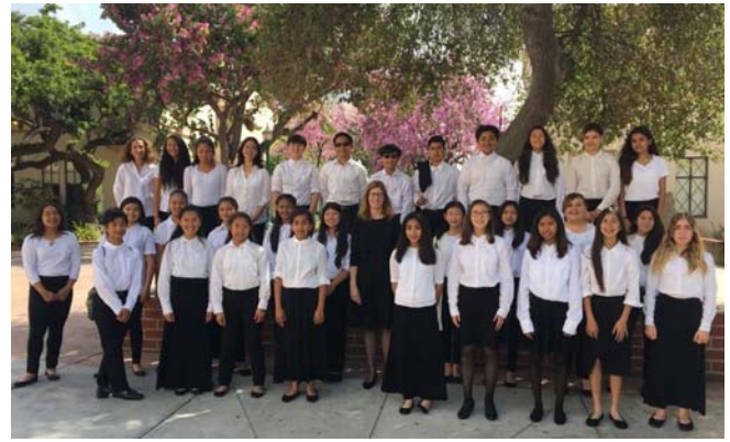
Columbia Middle School (CMS) Choir