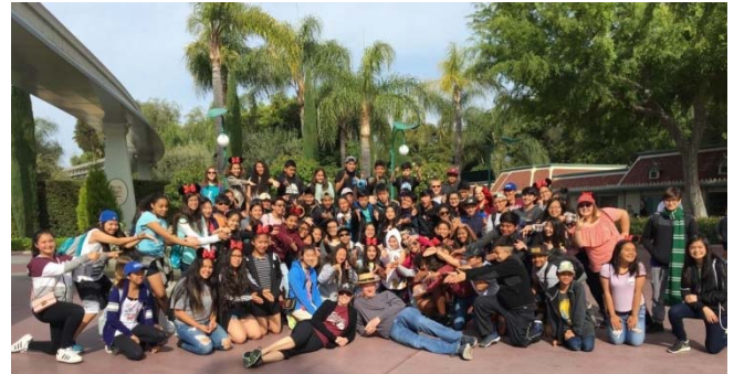
CMS's Band, Orchestra and Choir that performed at Disneyland

Columbia Middle School's Music Department took to the stage this past Saturday, April 8 th to participate in the annual World Strides Heritage Music Festival at Fullerton College. CMS was one of over 30 participating schools, comprised of over 40 directors and almost 2,000 students.