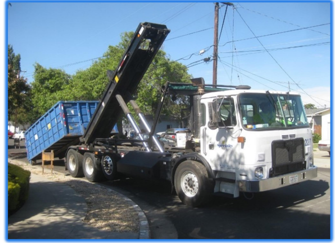
Dumpster being delivered on W. Fernwood Circle, June 11, 2016.