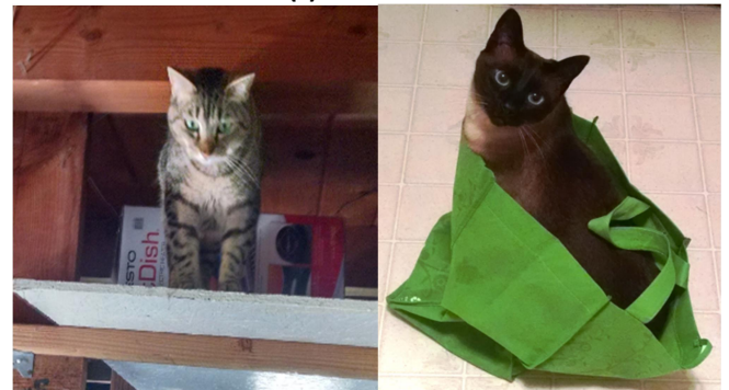
This is Rory and Romy; two rescue kitties who like to get into mischief – like climbing in the garage rafters and getting into empty grocery bags.