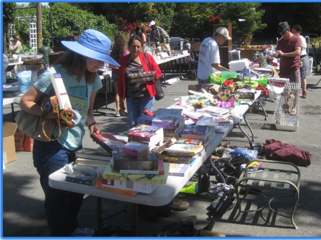
Shoppers at SNAIL yard sale on Carolina Ave.