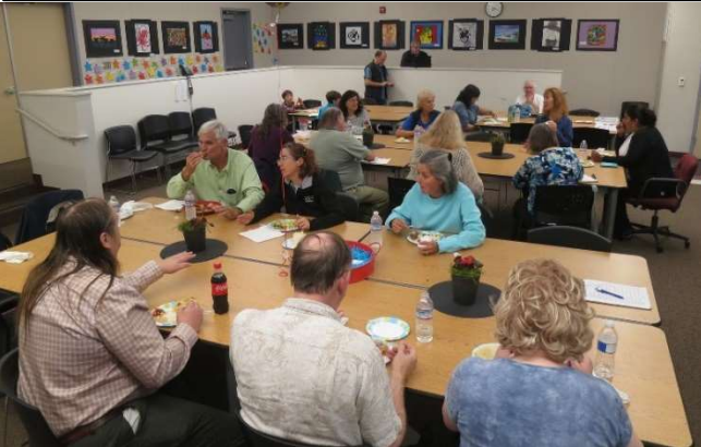
SNAIL neighbors enjoying a Cinco de Mayo feast before the May 5 th General Meeting.