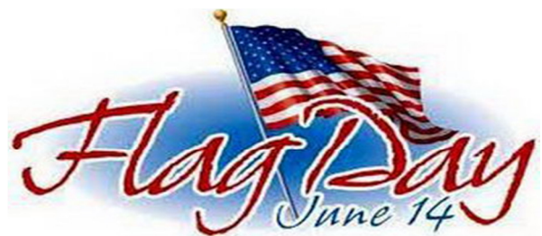
Flag Day commemorates the adoption of the U.S. flag on June 14, 1777 by resolution of the Second Continental Congress.