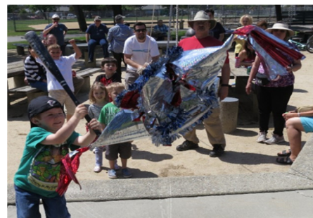
The kids and a piñata provided entertainment for everyone at the SNAIL Cinco de Mayo party on May 2, 2015.